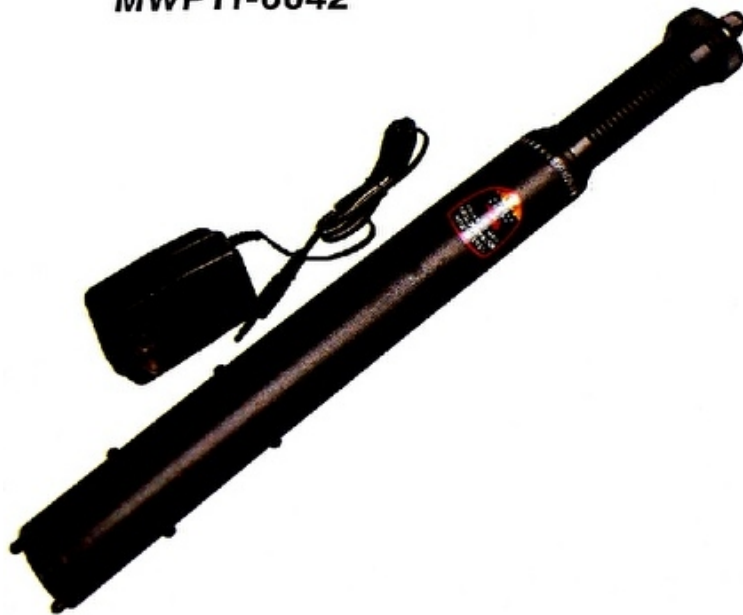
MyWay stun baton - 2.jpg