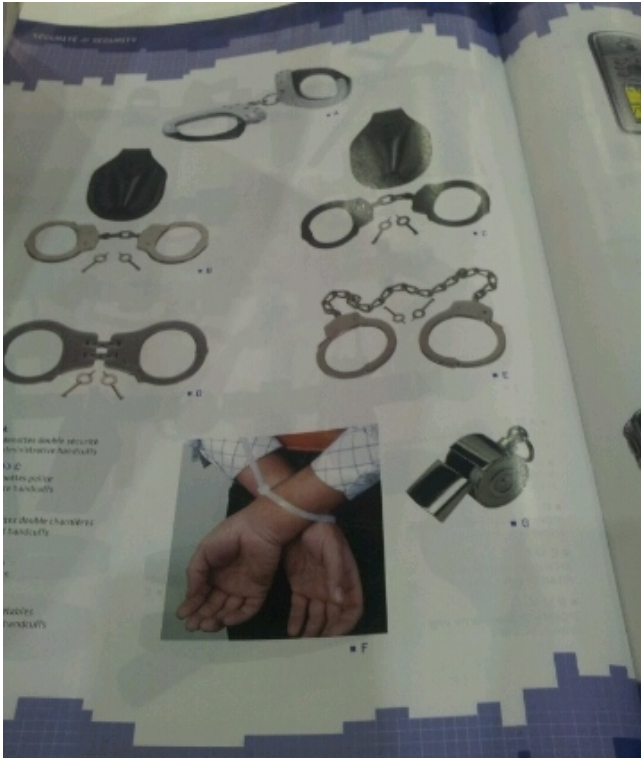
Magforce leg cuffs - 1.jpg

Specifically the .jpg files were as follows (cropped to highlight product):